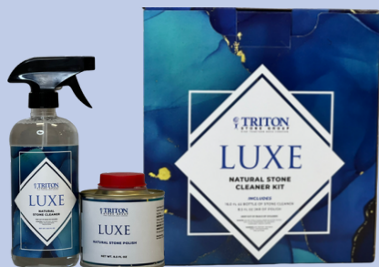
Luxe Natural Stone Cleaner Kit

SPECIALLY FORMULATED TO CLEAN, SHINE & PROTECT CRESCENT QUARTZ SURFACES!