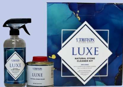
Luxe Natural Stone Cleaner Kit

SPECIALLY FORMULATED TO CLEAN, SHINE & PROTECT CRESCENT QUARTZ SURFACES!