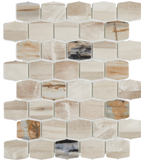
La Jolla - COST02221P