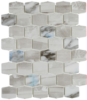
Big Sur - COST01221P